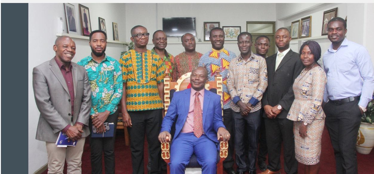
The Vice-Chancellor and other members of staff during the presentation.

The Vice-Chancellor was full of praise for the two lecturers for their spirit of giving to the University and said the gesture was worthy of emulation. He was also fascinated by the design of the Chair and the associated Adinkra symbols and what they stand for. He emphasised that no human being can pretend to be an epitome of knowledge and therefore, encouraged all present to approach him when they conceive any progressive idea.