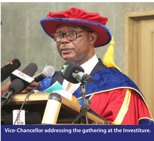
Vice-Chancellor addressing the gathering at the Investiture.