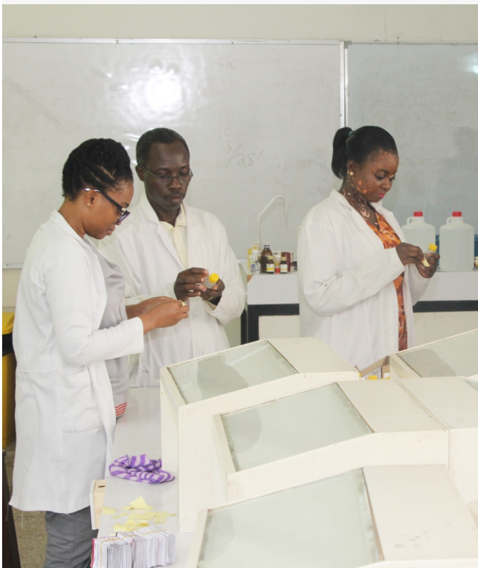
Some members of the sanitizer production team at the laboratory.

The exercise which was spearheaded by the Public Relations Office of the University in conjunction with KSTU Health Directorate and the Pharmaceutical Department was meant to promote education on COVID-19. In addition