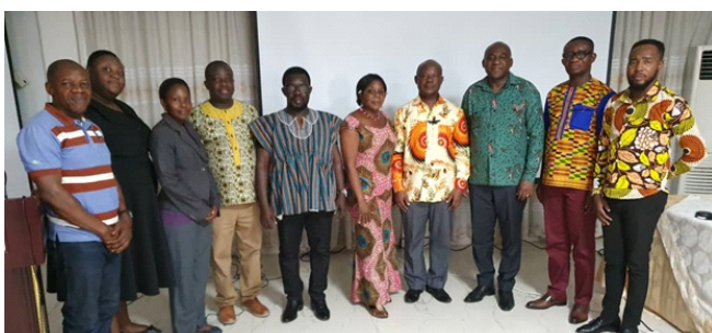
Some members of the Planning Committee with the Vice-Chancellor (7th from left) and the Facilitator (8th from left).

The good news is that the vision and the new ways of doing things in the University have caught up well with all and sundry which have rekindled positive attitude to work and yearning for results among the staff in Kumasi Technical University.