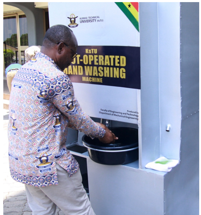
The Vice-Chancellor using the FOHWAM.