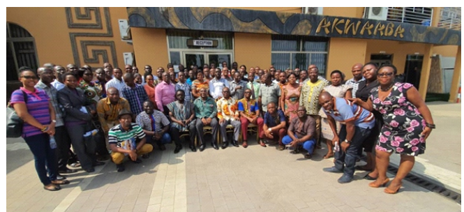
Participants after the retreat.