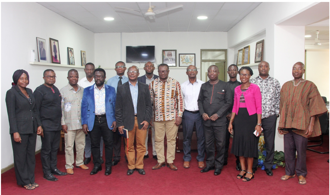
The Strategic Plan Committee with Senior Management .