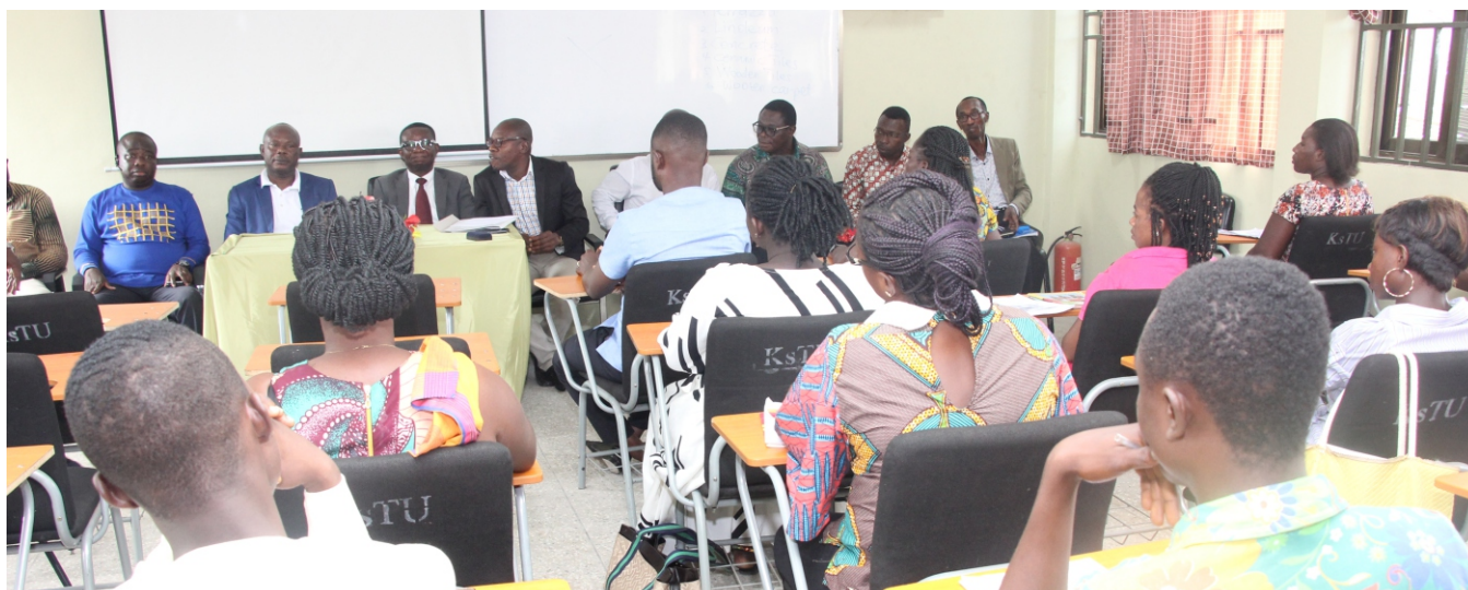
A cross section of participants during the launch of the programme.