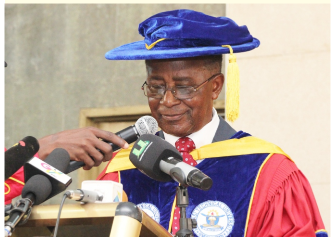
Chairman of the University Council addressing the gathering during the Investiture.