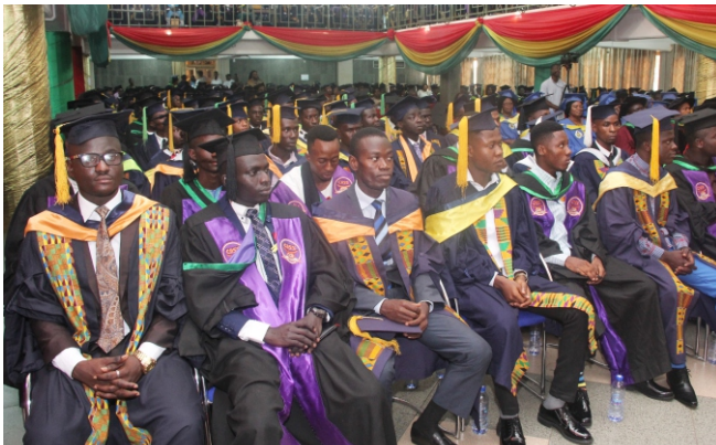
A section of the graduands during the Congregation.

The 15th Congregation of Kumasi Technical University (KsTU) was held on Saturday at the New Great Hall of the University with 2,653 people graduating. This comprised students who completed various programmes of study in the 2018/2019 academic year. Out of the 2,653 graduands, 890 were females while 1,775 of them were males. The graduands received certificates in Bachelor of Technology (BTech), Higher National Diploma (HND), Professional and other Diplomas.