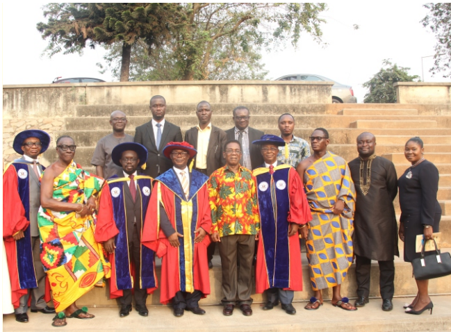
A group picture of the new Vice-Chancellor and some Council members of KSTU.