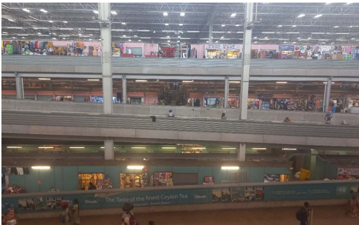
Fig. 4: Kejetia Abesefo dwa a etoatoa beberee wo Kumasi kuro mfɔnfini pɛɛ no

atoyerenkyem a ebetumi aba. Dee ehia titiriw bio nso ne se ese se mpaninfoɔ hwe se nnwuma kuo nketewa biara a ode ne nkrataa ko se ope mmoa no nensa beka na aka ne ntemso. Nnwuma kuo akeseɛ a wo de won adwatondee ba dwaso no nso betumi atete won nnooma so ama won a wo ne won di dwa no na ama won kon mu ahenhane won wo atoyerenkyem bere mu. Adwadifoɔ akuo akuo no nso betumi ako won ho won ho mmoa afiri won fotoɔ mu.