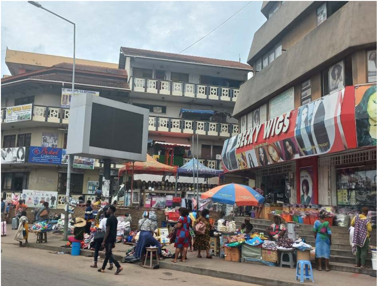
Fig. 2: Makola shopping Mall Anim

bi so kaa wɔn ho bɔ mu ye adwuma na wɔ fa adwenfua wɔ kwan a wɔ befa so anya atoyerɛnkyem a ɛbetumi asi daakye wɔ dwa ahodoɔ a ɛwɔ saa akwankyerɛ tiawa yi mu no ho, ye be da deɛ ɛfiriri nhwehwemuu no mu baaɛ no adi wɔ mfasodeɛ a ɛwɔ mu sɛ ye de ahohia bere mu nhyehyeeɛ be gu akwan mu wɔ yen dwa ahodoɔ mu. Ɔfa a ɛdi kan no, kyerekyerɛ ɔhaw ahodoɔ bi a ɛbetumi aba wɔ bere a ye de ahohia bere mu mmoa yi redi dwuma sɛ deɛ ye huu no wɔ dwa mmiensa a ye de yeɛ yenhwehwemuu no wɔ Kumasi ne Nkran mu no. Nteaseɛ mapa a ye be nya no be boa ama y'aye nhyehyeeɛ ato ho ama daakye. Ɔfa a ɛto so mmienu no kasa fa nsusueɛ mmiensa a ɛbe boa ama daakye y'atumi agyina wɔ atoyerɛnkyem bere mu wɔ ye dwa ahodoɔ mu.