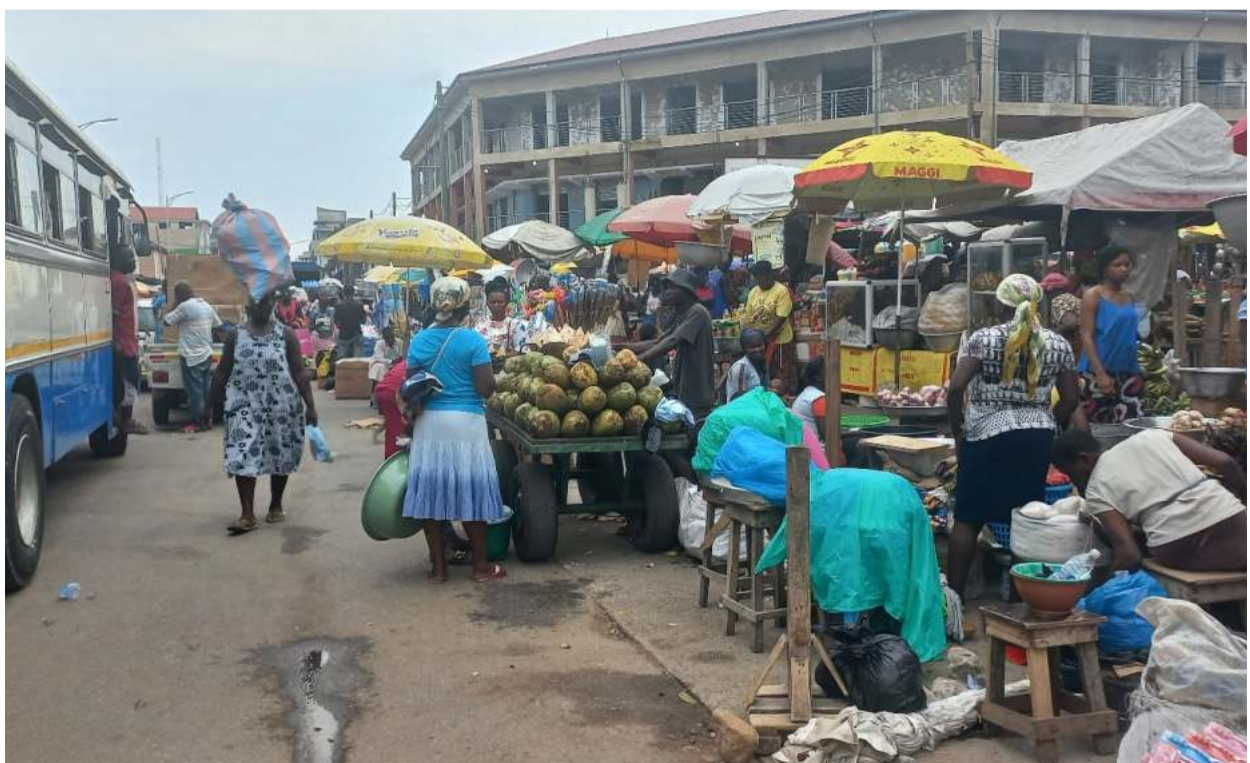
Fig. 3: Adwadie nkitahodie ahodoɔ a erekoso wo 31st December dwa mu

Atuwohoakye na enni ho se ye de nnooma a ye de hohoro yen nsa besisi mmontene so. Ye redi yen nsa ho ni - wo bere a ye rehohoro yen nsa bere ano anaa se ye de nnuro a ekum mmoawammoawa efefa fa yen nsa ho no ye okwan pa a eboa ma ye ko tia Covid-19 ne nsaa yadee ahodoɔ. Nsa hohoro be yee adee a eho hia no, emaa mpaninfoɔ a ededa dwa a ewo Nkran ne kumasi ano de bokiti ne samena nsuo sisii ho de nnuro a ye de fefa yen nsa ho kum mmoawammawa sisii ho de hyee mu kena. Ankore ankore, nhenfo ne nɔwuma kuo binom na efaa saa ahonidie nnooma yi nyinaa ho ka. Na saa nnooma yi saae no, na yen nya aforo a wo befa ho ka bio. Na nhyehyee biara nso nni ho se adwadifoɔ no ara beka won ho abom afa ho ka. Na enye won a wo te sotoɔso ano, paawoopaaforo ne troɔgo priaforo nso asedee se won nsesa nsuo ngugu bokiti a na esisi ho no mu bere ano bere ano. Eno nti emaa nnawotwe kakra bi akyire no, nsa hohoro no bre ase wo Nkran ne Kumasi dwa ahodoɔ no mu.