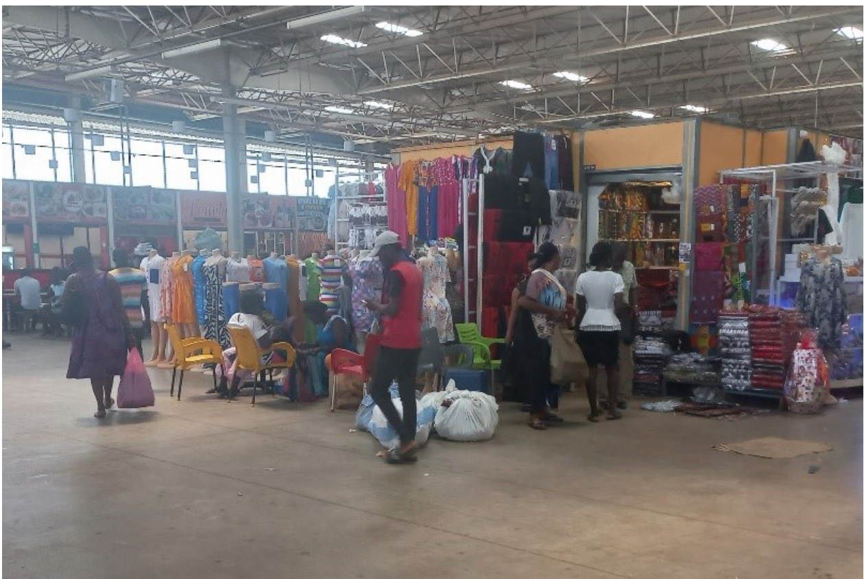
Fig.5: Nnuane ne Ntaadee Adwosuo wo Kejetia dwa foforo no mu wo Kumasi

Bere a wiase nyinaa akwan ahodoo a wofa so si yare mmoawa ano no etu mpon na wo tumi de di dwuma wo mmeaee pii no, eho hia se oman biara paw nhyehyee a ese fata na obetumi de adi dwuma. Se anka wobetoto dwa ahodoo mu anaa se wobe ma ebinom aba nne na ebinom nso aba n'adekyee no na wo de ahwe se kwan be deda nipa ntem wo dwa a eho na nipa dodoo no ara nya won ano aduane firi no, mpaninfoo a won adwene nsi ahonidie mmom so. Wo mma nsiensie ntaa nko so na afei nso won mfa nnuro mpetepete ho. Ampa ara, nsa hohoro ho nhyehyee ne nnuro a wo de be mpetepete ho no nye den se wo be ma kwan adeda nipa ntem. Saa nhyehyee yi mfa ohaw pii mma nnwuma ne adwadifoo sika sem so, enkanka ne won a wonni bie. Dee ehia wo mu ara ne se mpaninfoo no be nya ahofama na wo de akadee a ebe ma ahonidie ako so agu ho.