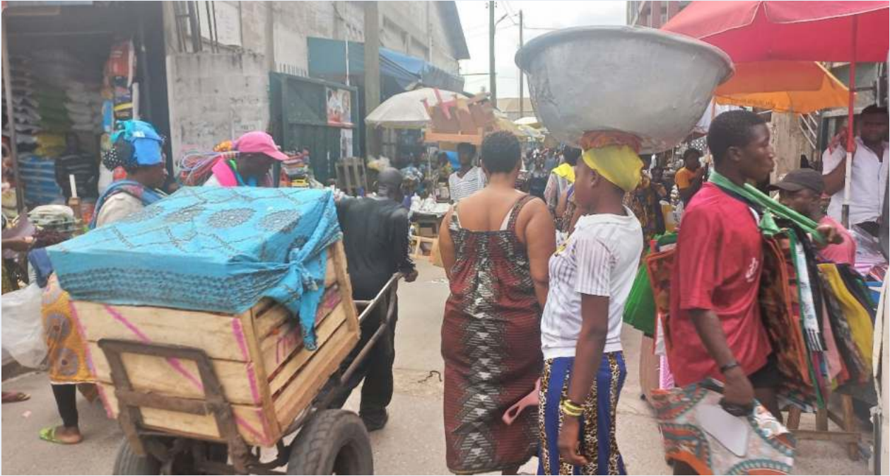
Fig. 6: Obi a crepia troɔgo a entoos adaka si soɔ wɔ 31st December dwa mu

ama y'aye ntotoee pa a ebe boa adwadifoɔ ne amansan nyinaa. Ewɔ mu se nhwehwemuu no kɔɔ so wɔ Ghana ha dee, nanso, eho nsunsuansoɔ be boa abibirem atɔee aman no mu bi wɔ nsaa yadee ho nhyehyeee ne nentotoee wɔ wɔn dwa ahodoɔ mu.