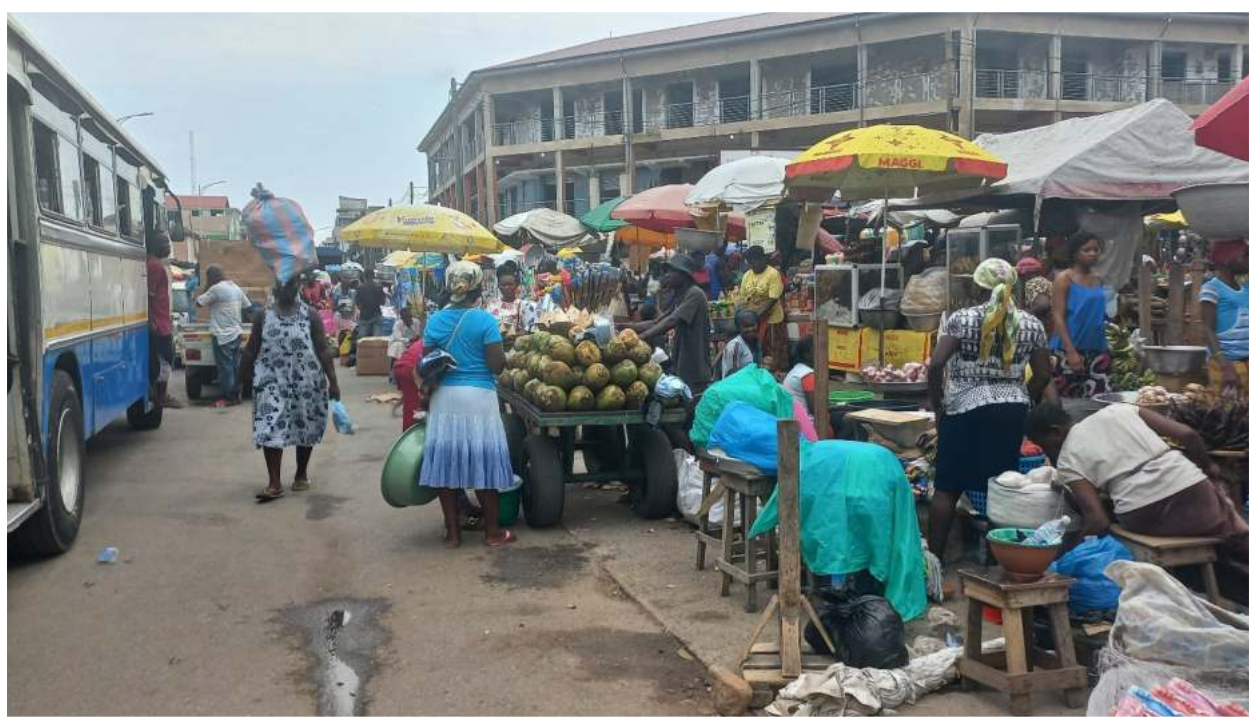
Fig. 3: Guɔyɛloɔi ni miiya nɔ oyayai yɛ 31st December jara lɛ mli

De falefale – kɛtsɔ de fomɔ bɛ fɛɛ bɛ kɛ/aloo tsofai kɛhad Ōhand sanitizerɛ– ji gbɛ kome ni ato he gbejianɔ ni yɛɔ omanyɛ ni haa abaa COVID – 19 kɛ tsɛɲɛmɔ helai srotɔi ni gbɛɔ eshwaa lɛ shi. Bɛ mli ni de falefale feemɔ he bahia yɛ bɛ mli ni COVID-19 kɔɔyɔ helai je ehia kpoAs hand hygiene became critical in the wake of the COVID-19 pandemic, jarayeli he nɔkwɛloɔi ni yɔ Accra and Kumasi masi fee nibii ni bayɛ ebua de fomɔ ni ji Veronica buckets – ni nu yɛ mli – ni samina nu fata he kɛ de tso fa (hand sanitizers). Nɛkɛ falefale feemɔ he nibii ni akɛhaa lɛ je ankrɔaɲkroi, blema tsemɛi anɔkwɛloɔi (traditional authorities) kɛ nitsumɔheɔi kpanaa (corporate institution) adeɲ. Keji nibii nɛɛ ni akɛha ta, abɛ shika jɛshɛ ni akɛ baahe nɛkɛ falefale feemɔ he nibii ni akɛ tsuɔ nii yɛ jarayeli hei nɛɛ. Agbɛnɛ hu akɛ guɔyɛloɔi efeko gbejianotoo ko ni abaaha amɛ falefale feemɔ he nibii nɛɛ ni amɛkɛ tsuɔ nii yɛ jara lɛ mli. Shwapo awalɔi, nii terelɔi kɛ trɔke tsilɔi hu nuu he akɛ esani amɛkɛ nu awo Veronica buckets bei fɛɛ bei. Kɛfata he hu, de fomɔ gbejianotoo, yɛ bei pii amlɔi, ba shi yɛ otsi fioo komɛi asɛɛ ni nyiɛ ekɛnitsumɔ yɛ jarayeli hei ni yɔ Accra kɛ Kumasi.