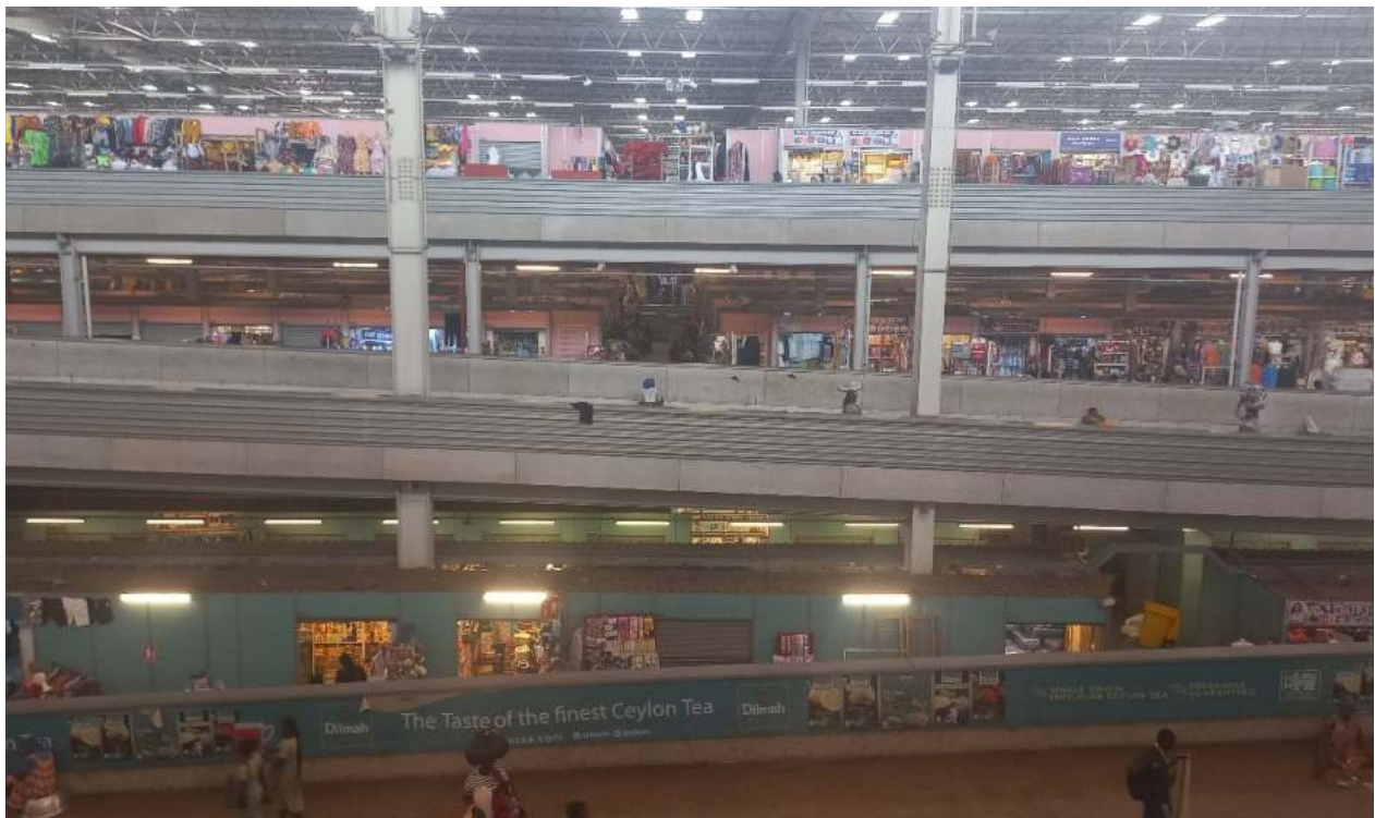
Fig. 4: Ijwɛitsu ni ahɔɔ nibii srɔtoɔ yɛ mli yɛ Kejetia jara ni yɔɔ Kumasi tɛɲ lɛ

waa, esani nɔkwɛlɔi abɔ mɔdɛɲ ni eha mɔfɛɛ mɔ aɲmala woji ni amɛkɛ ha, titrii lɛ nitsumɔ bibii kɛ ewuji fɛɛ, ni atsu he nii ni aha amɛ shika pɛpɛɛpɛ. Nitsumɔi ni yɔ Ghana, mɛi babaoɔ ji mɛi ni kɛ nibii haa ni ahɔɔ yɛ jarayɛli hei, ni amɛ baanye amɛfee pii kɛtsɔ nitsumɔ lɛ sɔ ni ka amɛnɔ yɛ amɛkɛ shramɔ mli yɛ ekolɛ nibii ni amɛ kɛ baaha guɔyɛlɔi aloo ni amɛ baa tse nibii anɔ aloo ni amɛ baafi (anɔkwayɛli) guɔyɛlɔi asɛɛ kɛ heyɛli shika be mli ni kɔɔyɔ hela ba. Guɔyɛlɔi akuu baanye hu ni amɛfi amɛ kuu mli bii asɛɛ kɛtsɔ shika ni ato kɛha mɛi ayɛli kɛ buamɔ nɔ.