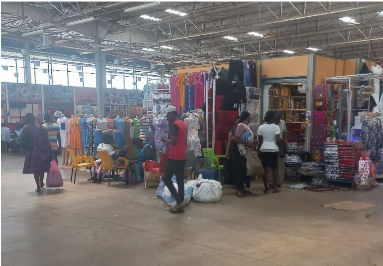
Fig. 5: Nihomɔ ni yaano oyayai ye 31st December jara le mli

Ye be mli ni jeɣ fɛe gbɛɣianɔtoo ye tseɣemɔ helai akudumɔ le ni eye omanyɛ ni ake mli tsu nii ye hei babao, ehe miihia ni maɣ fe maɣ ahara gbe ni hi keha ame shihile. Ye nɔ najianɣ ni abaa ɣamɔ jarayeli hei nɛe aloo atsake meɔi abe ni ameke baaya nitsumɔ koni no aha ake he aka shra ye jarayeli hei nɛe ni meɔi babao tsuɔ nii ni wolo kaa he ni ame wala damɔ daagbi nihomɔ shika ni ame feɔ nɔ, esani jarayeli nɔkwelɔi ke ame hewale awo falefale feemɔ he nibii ni ame baato he gbɛɣiano ye jarayeli hei nɛe ketso hetsemɔ hieyaa ke kooɣɔ mli tsofa ni abaashi (fumigation) be fɛe be. Leɛleɣ, deɣ fɔmɔ he gbɛɣianɔtoo ke daa kooɣɔ mli tsofai ni abaashi (fumigation) ji gbɛi ni yoo mleo ni ake baatsu ni moɣ fe meɔi ni ake shraa he gbɛɣianɔtoo. Neke gbɛi nɛe baa nagbaai ke nitsumɔi ke shika shihile keha jarayeli nitsulɔi shi, titrii le kuu ni amɛbe hewale. Nɔni ataoɔ ji nitsumɔ tsemɛi ahe tiumɔ ye nibii ni amɛbaaha ni bawaje falefale feemɔ ni akebaatsu nii.