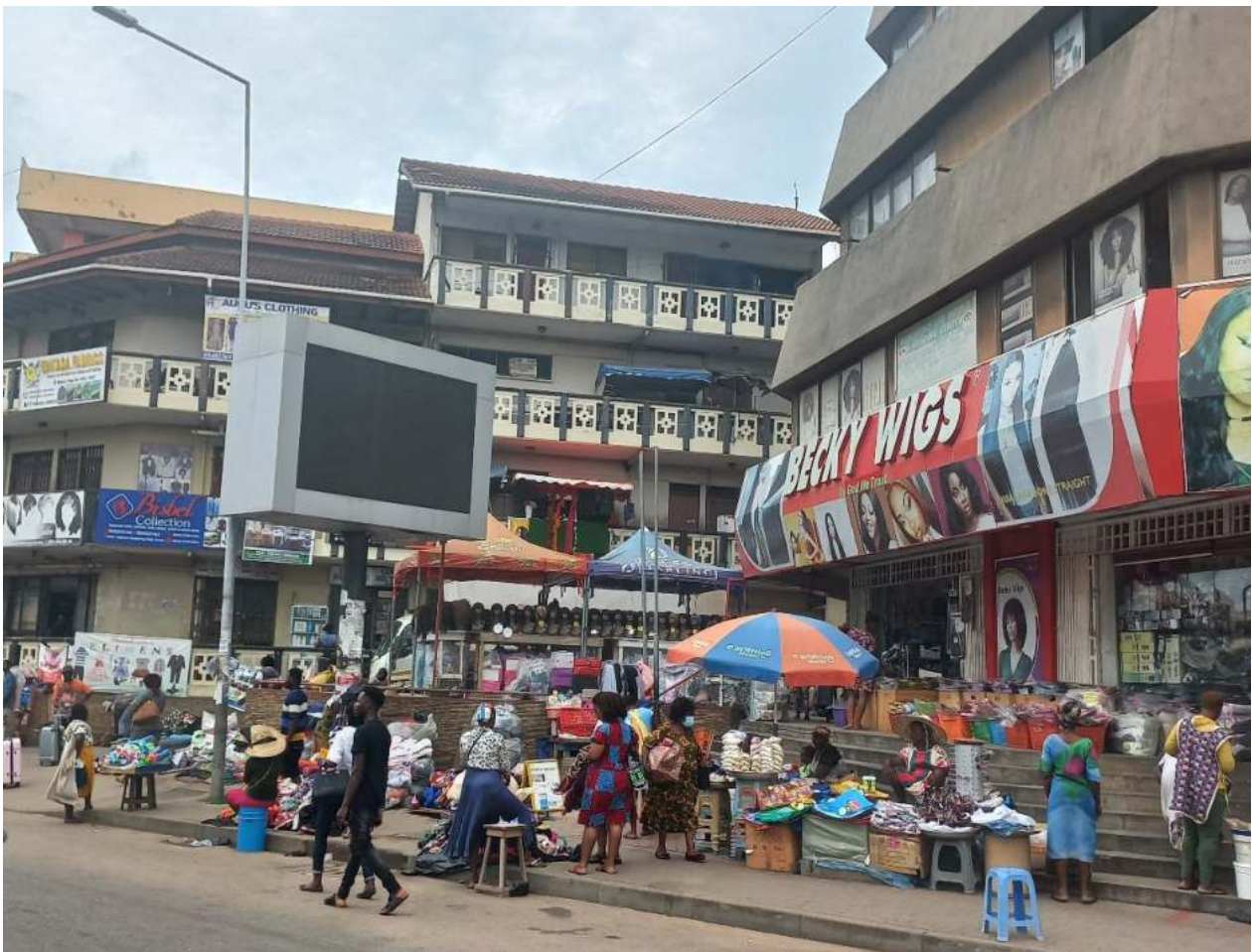
Fig. 2: Makola Shopping Mall hiɛ.

Ye nɛke akpo kuku nɛɛ mli le wɔ hara niamlitaomɔ ni kɔɔ he tɛɛ ke eba akpo gbetsiinii ye jarayali hei nɛɛ. Klɛɣklɛɣ fa le tsɔɔ nagbai komeɛi ni kɔɔ tɛɛɛmɔ hela kudumɔ gbetsiinii ke nitsumɔ ni ake kpe ye jaji etɛ niamlipeimɔ ni yɔɔ Kumasi ke Accra. Nii ashishi numɔ kpakpa ni kɔɔ gbetsiinii pɔtɛ nɛɛ he le haa aleɔ gbɛi ni esaake ako ketsu wɔsɛɛ saji ahe nii. Nɔni ji enyɔ le jeɔ ɣaawoo etɛ ni atsɔɔ nɔ anaa hiɛyaa ye kɔɔyɔɔ hela hewalɛwoo ye jarayali hei le akpo.